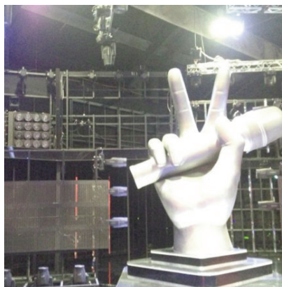
TV show "The Voice" in Italy on Rai2 channel (DRL12 black)