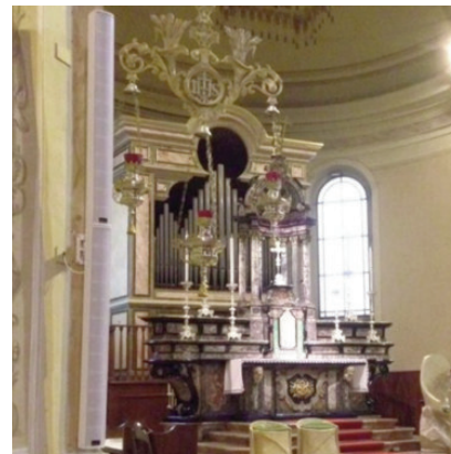
Calvenzano church (DRL12 white)